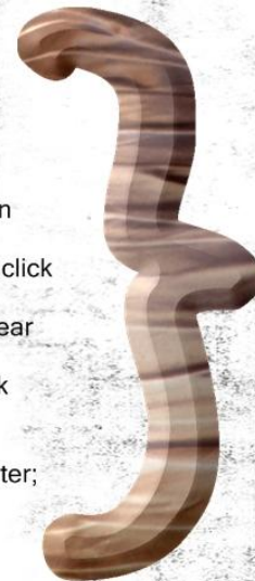
Carved Wooden Bracket